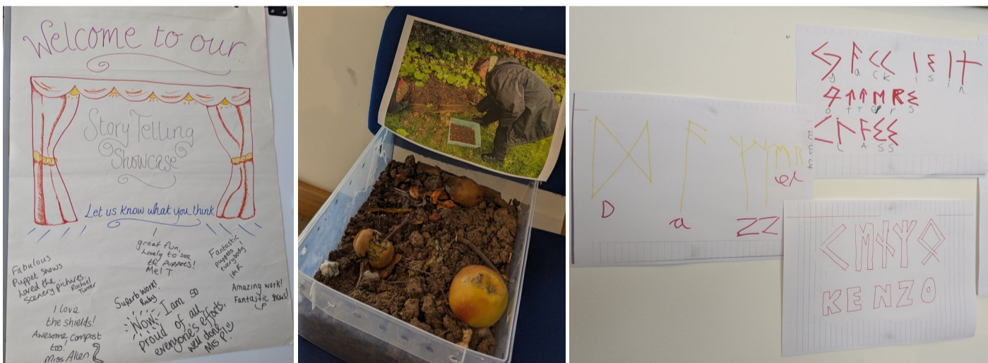
We had some lovely comments about the children's work! There were also lots of other things to see; highlighting all the fantastic learning the children have done this term such as creating a wormery, visiting a farm, learning about local history, writing in Runes, creating their own drinks, and playing basketball!