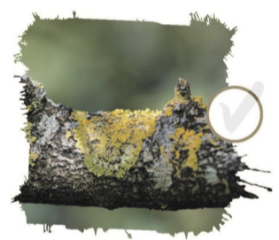
A lichen-covered twig