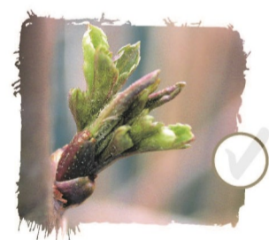
New green leaves