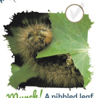
Munch! A nibbled leaf You might even find what's nibbling it!