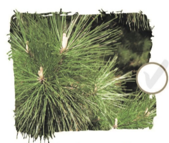
Prickly pine needles