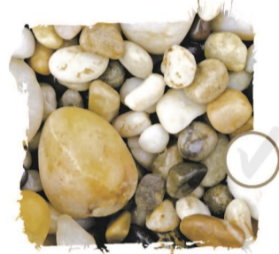
A smooth pebble