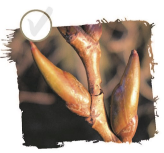
Sticky leaf buds