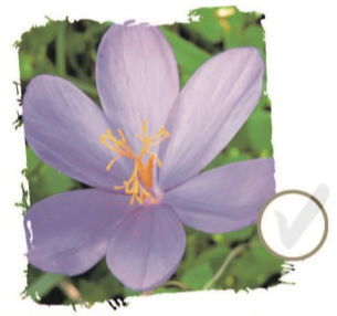
Silky flower petals